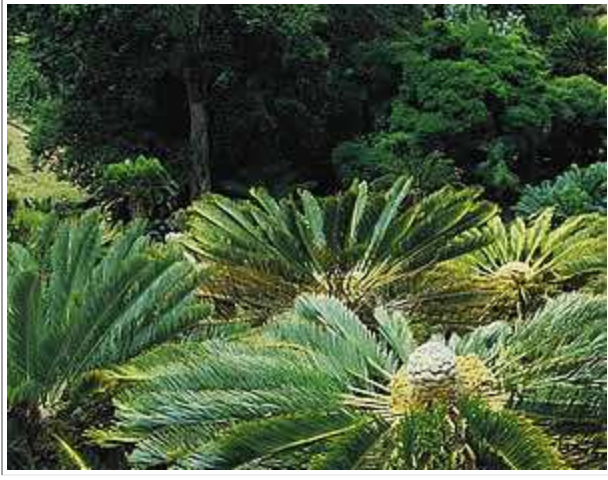
CYCAD ( ENCEPHALARTOS TRANSVENOSIS).

@ SIGNIFICANT PART OF THE MODJADJI DYNASTY WAS FORMED BY THESE CYCADS AND THE HISTORY OF THE RAIN QUEEN IS PRESERVED IN A SMALL MUSEUM AT THE ENTRANCE TO THE RESERVE.